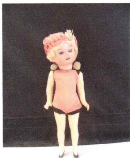
Porcelain Doll – Date unknown