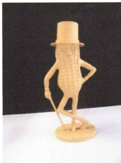
Circa 1950's. Planter's Mr. Peanut Bank